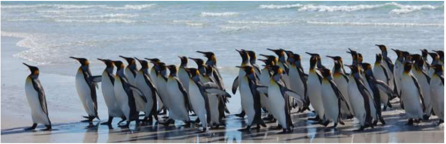
King Penguins at Volunteer Point, Falkland Islands