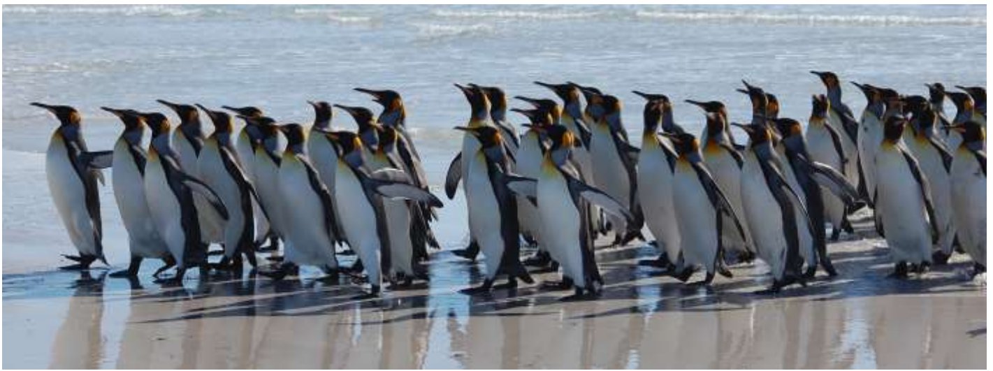
Volunteer Point, Falklands